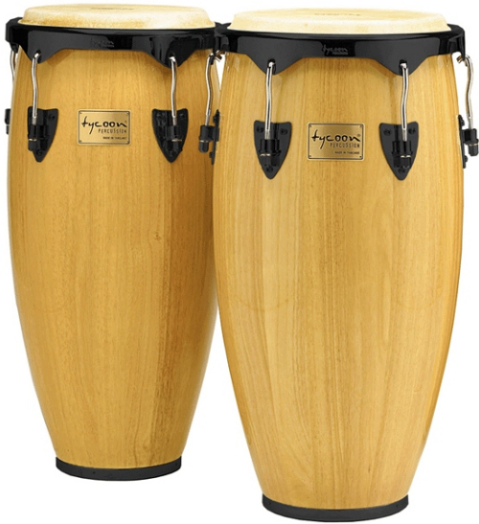
CONGAS (Quinto & Conga)